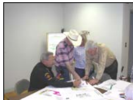
Community mapping workshop

Truth or Consequences is the county seat of Sierra County. The built core of the community is bounded by Interstate 25 to the west, the Rio Grande to the east, Elephant Butte to the north and Williamsburg to the south. Truth or Consequences began as Hot Springs, New Mexico and was incorporated in 1914. In 1951, the Town opted to enter a contest with popular game show host Ralph Edwards. Hot Springs won, and as a result, the game show was broadcast from the town. A special election was then held and the residents voted to change the name to Truth or Consequences. Still today, people request that the name return to Hot Springs since there are natural thermal springs in the community, in an effort to increase tourism. However, there are